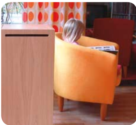
UNI@FRESH air cleaners are fitted with castors, so they can easily be wheeled from room to room.

Two models are available: the UNI@FRESH 100 and the UNI@FRESH 400. Both feature the same timeless design, making them suitable for all interior spaces.