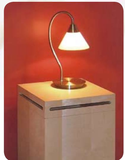
DESIGN by Harri Koskinen

People now spend the majority of their time indoors. The patented UNI@FRESH air-filtration system is well worth investigating.